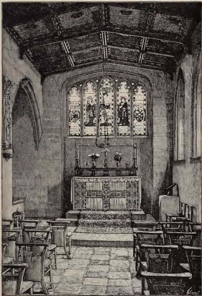
INTERIOR OF MEMORIAL CHAPEL AT ST. SAVIOUR'S, LEEDS.

outworks of the Church ; they are parts of a unity which has logically been surrendered when one portion has been